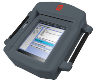
3. Go is ready

Verity Duo Go prints out a full-sized, voter verifiable ballot on the spot.