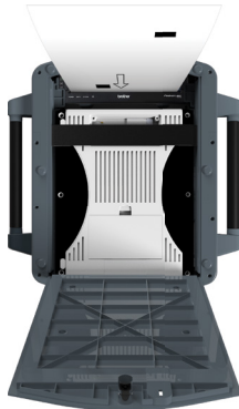
2. Insert tablet and paper