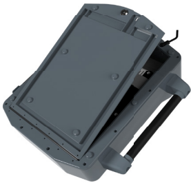
1. Unlock carrier