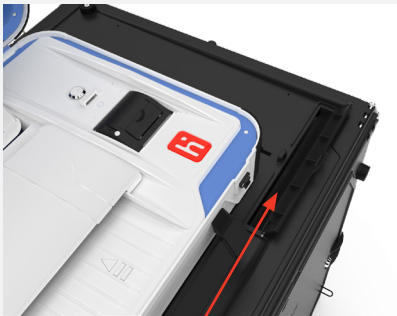
Voter emergency ballot slot

The ballot box collapses to six inches thin for easy transport and efficient storage. Unlike other scanners and ballot boxes, Verity Scan is accessible to a voter, whether standing or seated.