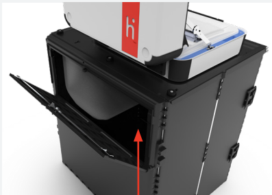
Emergency ballot access for poll workers