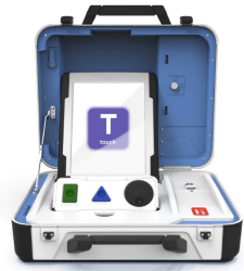
Touch with Access